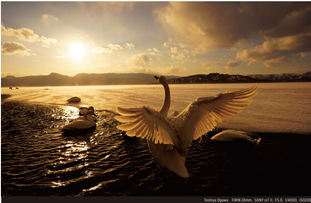
Toshiya Ogawa FIRIN 20mm, SONY α7 II, F5.0, 1/4000, ISO200