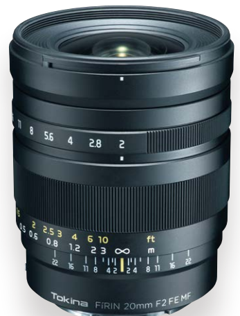
20mm F2 FE MF

Developed and manufactured in accordance with Sony-licensed specifications.