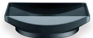
Lens Hood : BH-622 Wide Square Type with "Click and Lock".