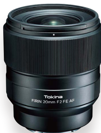
NEW 20mm F2 FE AF