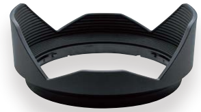
Lens Hood : BH-623 Lotus Bayonet Type with "Click and Lock".