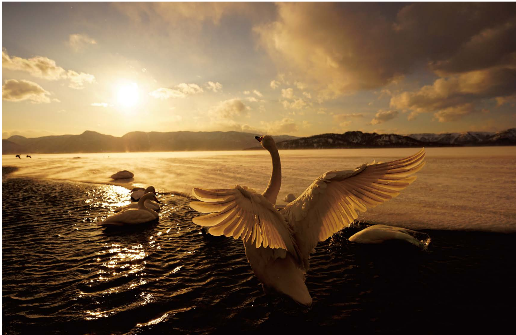
Toshiya Ogawa FIRIN 20mm, SONY α7 II, F5.0, 1/4000, ISO200