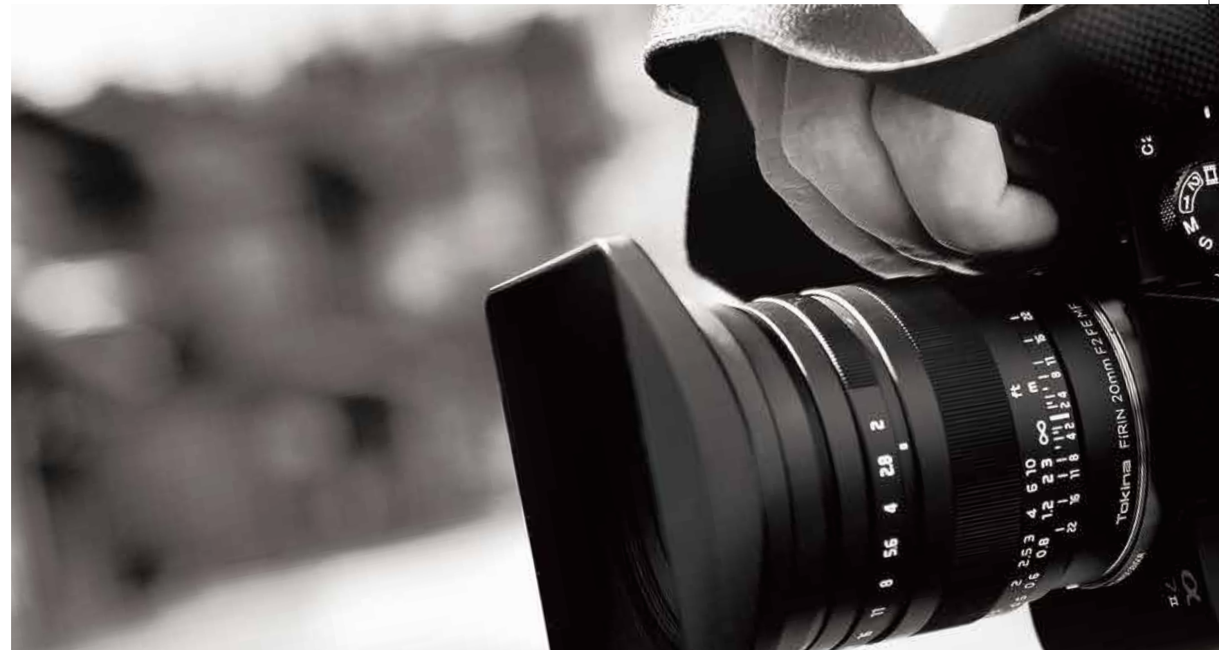
FIRIN 20mm F2 FE MF