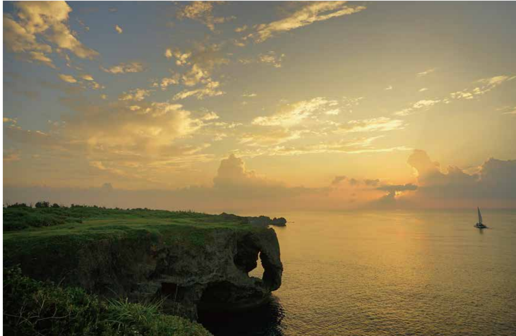
Ryosuke Takahashi FIRIN20mm, ILCE-7M2, F11, 1/80, ISO100