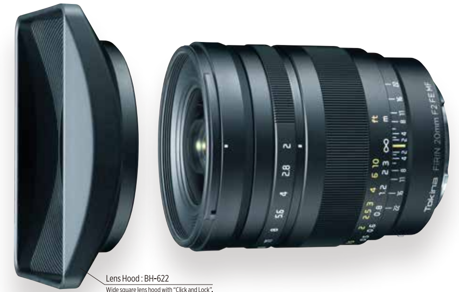
Lens Hood : BH-622 Wide square lens hood with "Click and Lock".