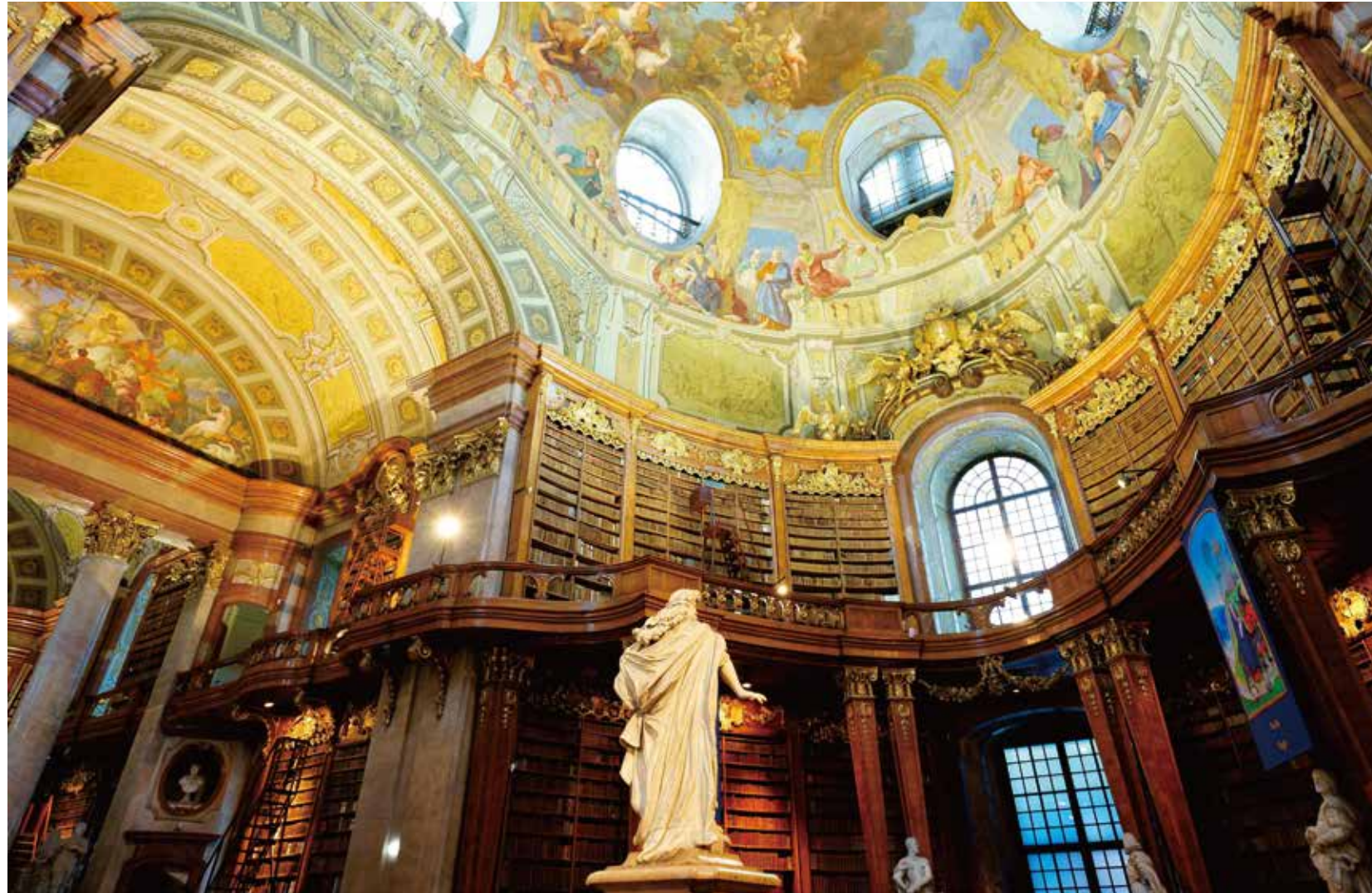
Toshiya Ogawa FiRIN20mm, ILCE-7M2, F5.6, 1/15, ISO1250